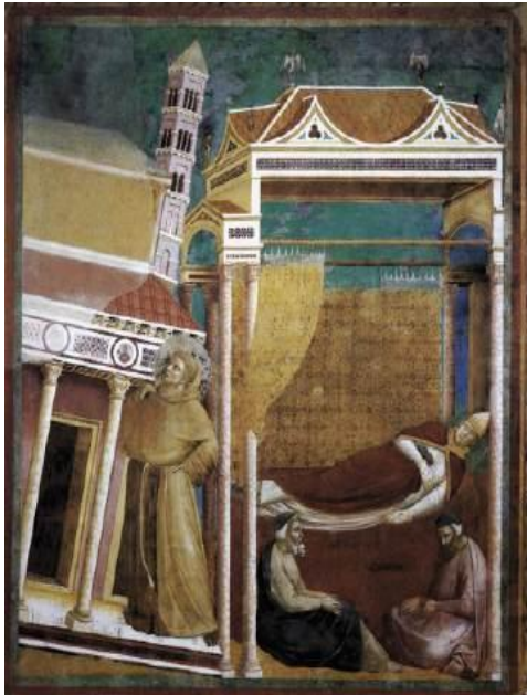
Figure 6, Dream of Innocent III , Assisi

Taken together, these two examples show in different ways the desire to use empirical perspective to remediate the view from the anchored viewer's position. 75 But I want to suggest that this seemingly revolutionary impulse is quite old and in the case of the Vision of the Thrones indistinguishable from Byzantine practice. Yet the effect is new in the Dream of Innocent III , and in a number of other frescoes, such that the combination of the Byzantine style of optical correction combined with the new observation of reality and use of radical angles to create space, creates a new-old kind of image, which has not been seen before.