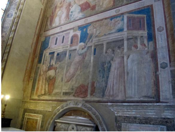
Figure 7 Giotto, Peruzzi chapel, c. 1320, Santa Croce, Florence

These observations allow us to see a pattern following Giotto. Some other painters in the trecento used similar effects, including immediately in a Florentine context the Pulci chapel in Santa Croce painted by Bernardo Daddi (1328-1330), 86 and the Baroncelli chapel decorated by Taddeo Gaddi (late 1330s). 87 Each uses the by-now reliable cue of an orthogonal emerging from the corner of the fresco and creating a strong sensation of depth. The effect is taken to virtuosic heights by Gaddi with the seemingly awkwardly depicted temple in the Presentation of the Baroncelli chapel, which looks perfect for someone standing just outside of the chapel.