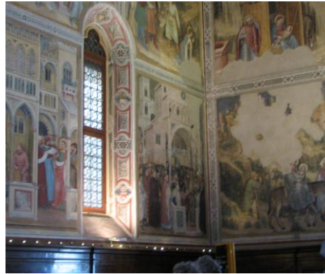
Figure 8 (left), Guariento d'Arpo, Vestition of St. Augustine , c. 1360-65, Chiesa dei Eremitani (SS Giacomo e Filippo), Padua