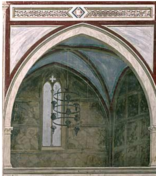
Fig. 10 Giotto, so-called coretti , Arena Chapel, Padua

Indeed, we can look to the fresco of Christ before the Doctors in Padua for such a precocious acknowledgement of the spectator. 90 The Scrovegni chapel is six registers long down the nave. This fresco appears on the left; thus for a centralised viewer standing at the centre, the left wall is opened up so as to accommodate an off-center viewer. This brings us back to Assisi. New ideas were circulating, and a