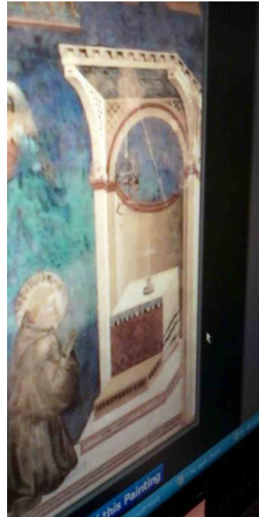
Figure 4 (left) Master of the Legend of St. Francis, Vision of the Thrones , Assisi