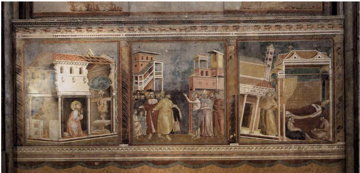
Figure 3 Master of the Legend of St. Francis, Bay 2, scenes 4-6, San Francesco, Assisi

Part, and perhaps a crucial part, of White's conclusions were derived from the perspective of the corbel frieze around actual half columns in two scenes. What I want to suggest is that successive interpretations, which have paid such close attention to the corbelling above the scenes, has in one way advanced the discussion but in another held it back (Fig. 3). A slavish geometric (and not merely space-producing) point of view is the culprit. The work of White consistently separates the question of geometry from space. Indeed, it is only by forgetting about the Alberti-like elements of the frescoes that one has any hope of discovering deeper space-producing tactics.