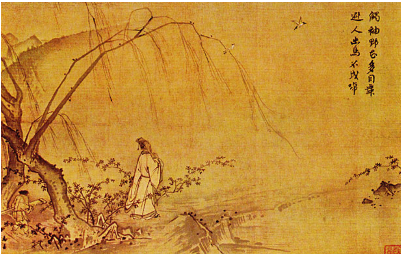
Ma Yuan (active 1190-1225), On a Mountain Path in Spring , Ink and color on silk. Southern Sung.