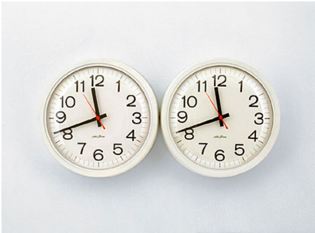
Felix Gonzalez-Torres, Untitled (Perfect Lovers) , 1991. Clocks, paint on wall. overall 14 x 28 x 2 3/4" (35.6 x 71.2 x 7 cm).

However, while film as such is a celebration of movement, in comparison to traditional art forms, it paradoxically drives the audience to new extremes of physical immobility. While it is possible to move one's body with relative freedom while reading or viewing an exhibition, the viewer in a movie theater is put in the dark and glued to a seat. The moviegoer's peculiar situation in fact resembles a grandiose parody of the very vita contemplativa that film itself denounces, because cinema embodies precisely the vita contemplativa as it would appear from the perspective of its most radical critic – an uncompromising Nietzschean, let us say – namely as the product of frustrated desire, lack of personal initiative, a token of compensatory consolation and a sign of an individual's inadequacy in real life. This is the starting point of many modern critiques of film. Sergei Eisenstein, for instance, was exemplary in the way he combined aesthetic shock with political