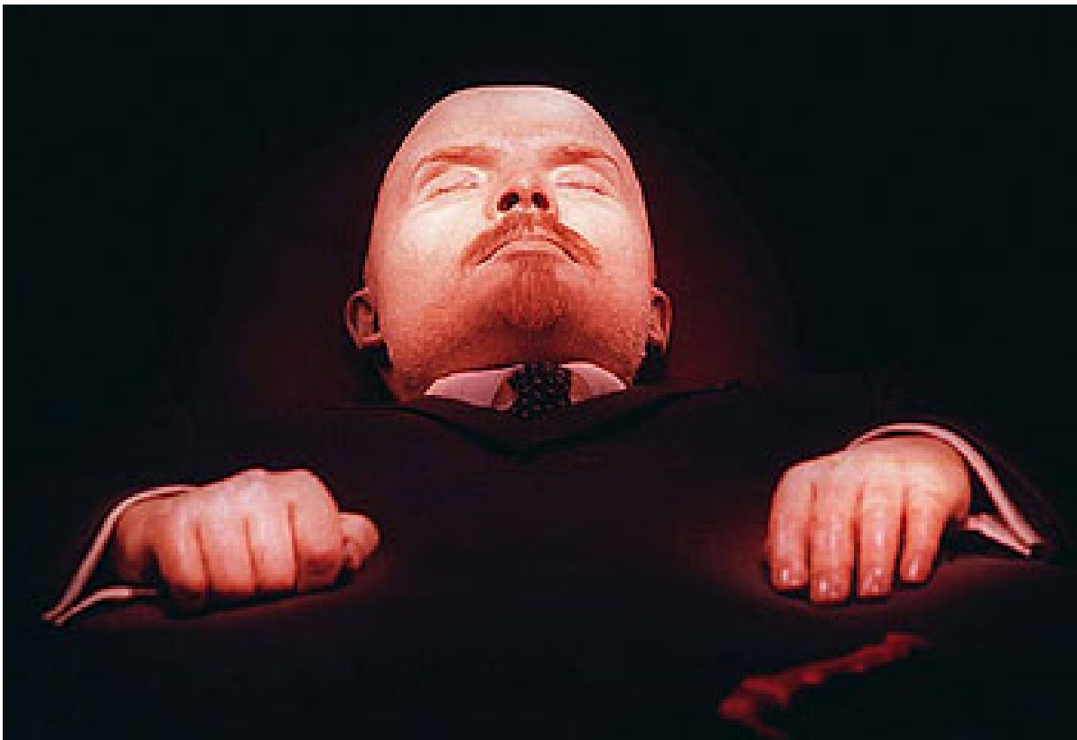
Lenin's embalmed/mummified body, permanently exhibited in the Lenin Mausoleum, Moscow, since 1924.

Hesitation with regard to the modern projects mainly has to do with a growing disbelief in their promises. Classical modernity believed the future to be infinite – even after the death of God, even after the loss of faith in the immortality of the soul. The notion of a permanent art collection says it all: archive, library, and museum promised secular permanency, an infinitude that substituted the religious promise of resurrection and eternal life.