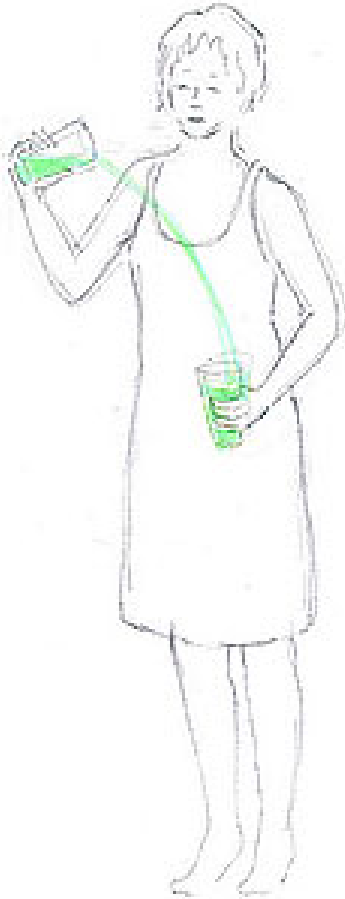
Francis Alys, Song for Lupita , 1998, detail. Pencil on tracing paper.