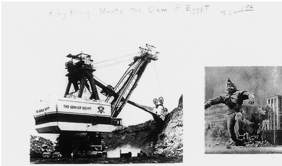
Robert Smithson. King Kong Meets the Gem of Egypt. 1972.

desperate for tourist revenue as local coal-seams have been depleted over the last half century. Faced with abandoned mines, toxic gob-piles, dead acid-drainage rivers, and de-populated ghost-towns, I discourage my students from indulging a simple poetics of rural dereliction, emphasizing instead aesthetic modalities such as the “spectral” and the “nonsynchronous” as the vanguard of twenty-first century art. 17 Teaching contemporary art and sustainability in Appalachian Ohio thus means, among other things, “learning to live with ghosts.” 18 Far from a melancholic fixation on the past, recognizing the “non-contemporaneity with itself of the living present” is the very condition of anything genuinely new to emerge in the future, and thus enables the “contemporary” to survive as an ethico-political question rather than a glib affirmation of novelty for its own sake.