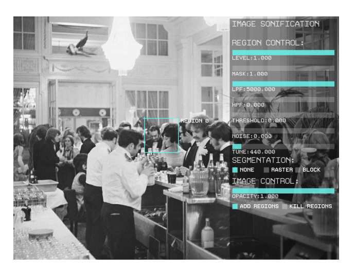
Figure 1: Software Interface for Voice of Sisyphus

Interactive sonification has been defined as "the discipline of data exploration by interactively manipulating the data's transformation into sound." [8] Our software's ability to drastically change the sound obtained from image regions through interactive manipulation of spectral amplitude thresholds and segmentation of regions into a melody of subsections (both described in section 2.3) could be classified as a form of interactive sonification. The composition process for the resulting artwork described in section 3 involved interactive adjustment of parameters within a given model defined by the composer. While the final artwork is not interactive, the process of its creation could be described as working with a model-based sonification [9], which is interactive by definition.