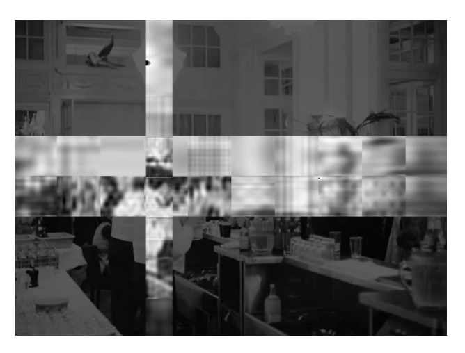
Figure 4: Excerpt from Voice of Sisyphus Containing 2 Segmented Regions

The software is completely polyphonic—that is, one is free to add as many regions as desired, limited only by processor performance. Filtering and segmentation can be controlled independently for each region. Figure 4 shows an screen shot from Voice of Sisyphus containing 2 overlapping segmented regions producing different melodies. The screen shot also shows the software's ability to change opacity of the source image to hide or reveal it in the background.