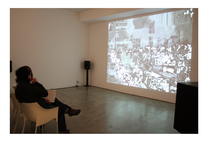
Figure 5: Installation of Voice of Sisyphus

teners standing near the entrance were drawn to the center of the room once they heard the rapid movement of sounds.